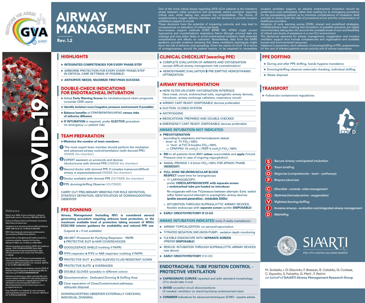
Figure 1 Società Italiana di Anestesia Analgesia Rianimazione e Terapia Intensiva guidance on airway management of the patient with coronavirus disease 2019.

Coronaviruses are typically found in the lower respiratory tract linked with angiotensin converting enzyme receptors, with the primary mechanism of transmission through contact and droplet spread of respiratory secretions, which